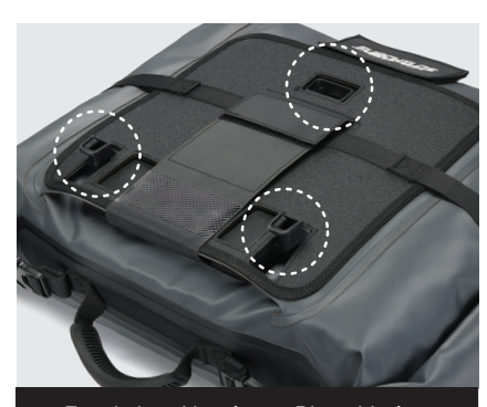
Furchtlos Aluminum Plate Variant