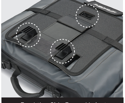
Furchtlos Side Frame Variant