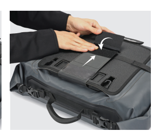
Ensure the circled areas are well aligned.