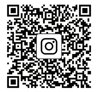
FOLLOW & TAG US @FURCHTLOSMOTO